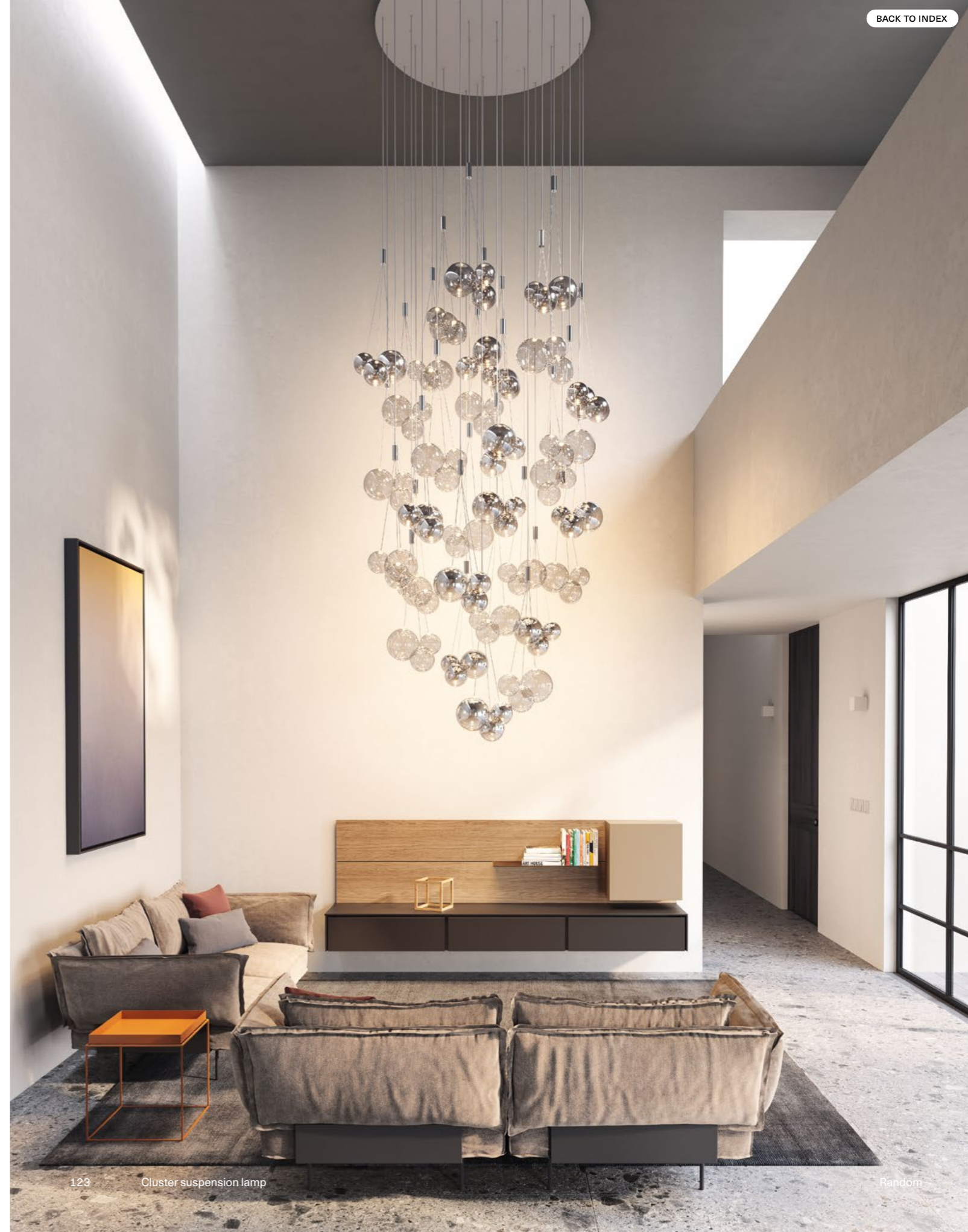
Random, composition of 36 lights on a round canopy , FINISHES Clear and Chrome.