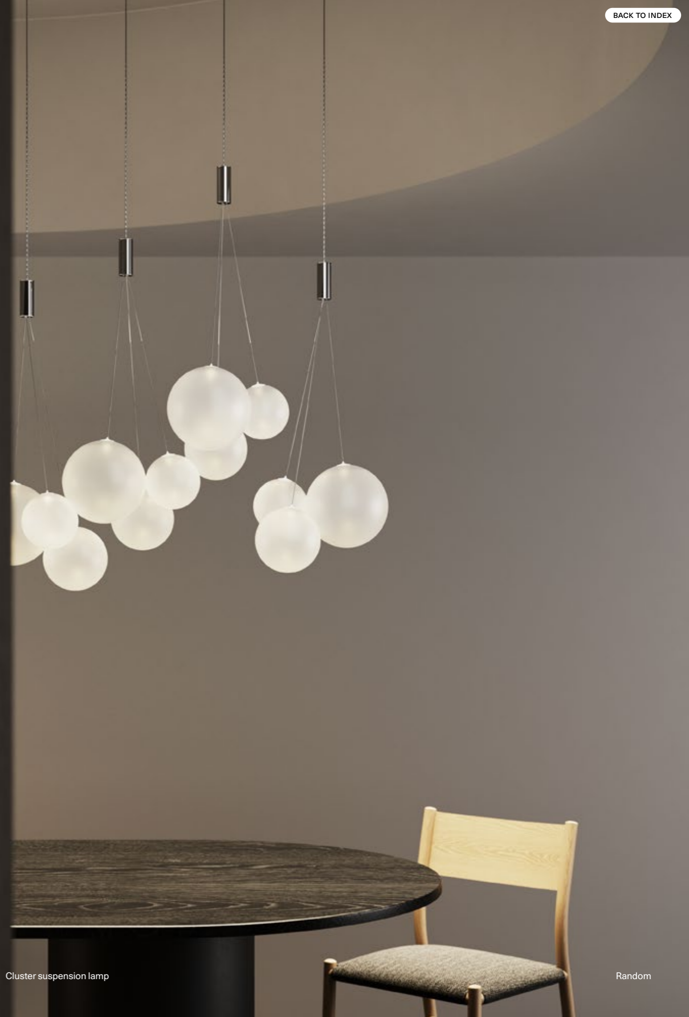
Cluster suspension lamp