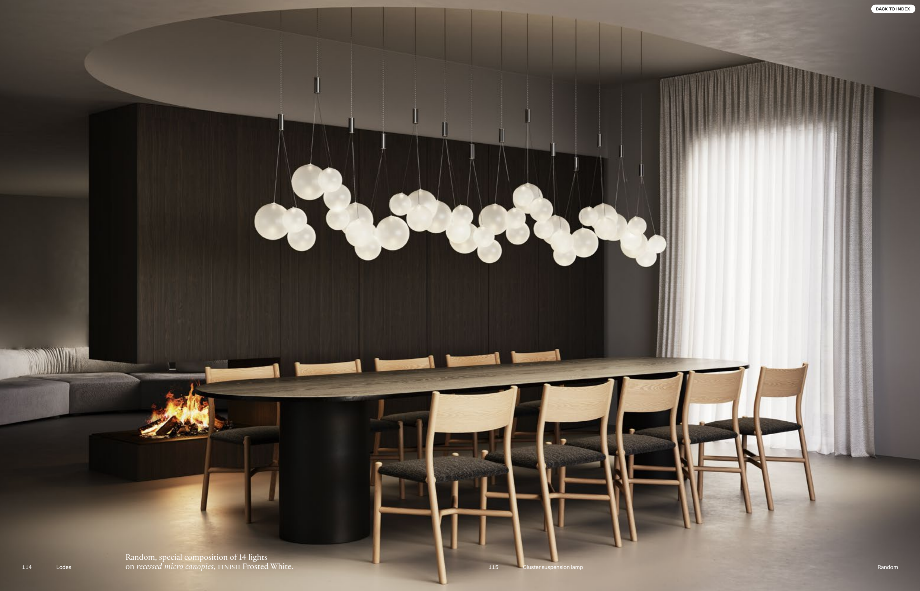
Random, special composition of 14 lights on recessed micro canopies, FINISH Frosted White.